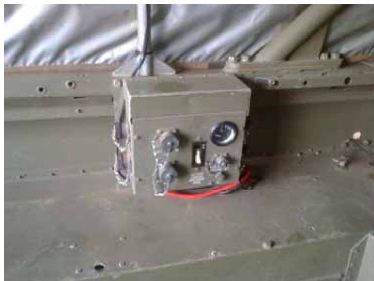
Figure 1 Power Distribution Box Position on LHS Tray Wall

3. When fitted to a Land Rover 110 4x4 variant the power distribution box is to be positioned in the rear tray area and mounted in a vertical position against the left-hand side as shown in Figures 1 and 2.