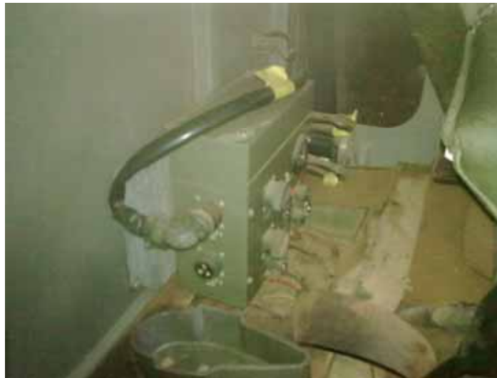
Figure 3 Power Distribution Box Positioned Behind Passenger Seat

4. When fitted to a Land Rover 110 6x6 variant the power distribution box is to be positioned on the cabin rear wall behind the passenger seat as shown in Figure 3.