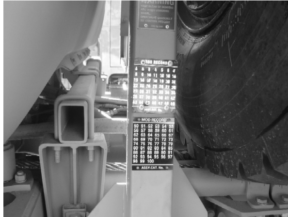
Figure 1 Location For MACK FOV (Less LRV and HRV)