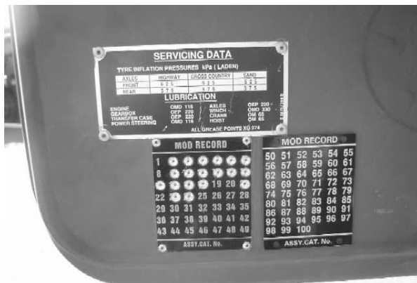
Figure 2 Location for LRV